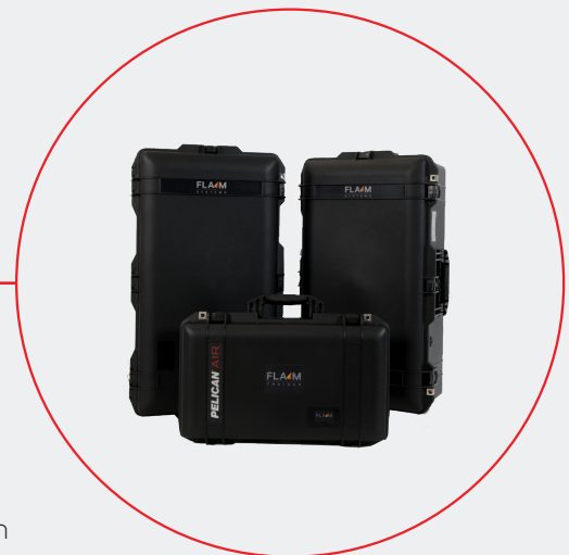
Figure 7: Standard packaging for the FLAIM Trainer system