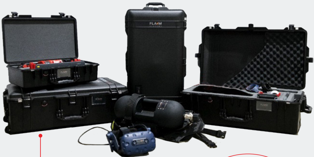
Figure 6: The FLAIM Trainer system

FS-FT2 excl. Hose Reel Assy and Heat Suit incl. 1yr Warranty, Licence and Software Subscription. FLAIM Trainer LITE can be upgraded by purchasing Hose Reel Assy. and Heat Suit at later date.