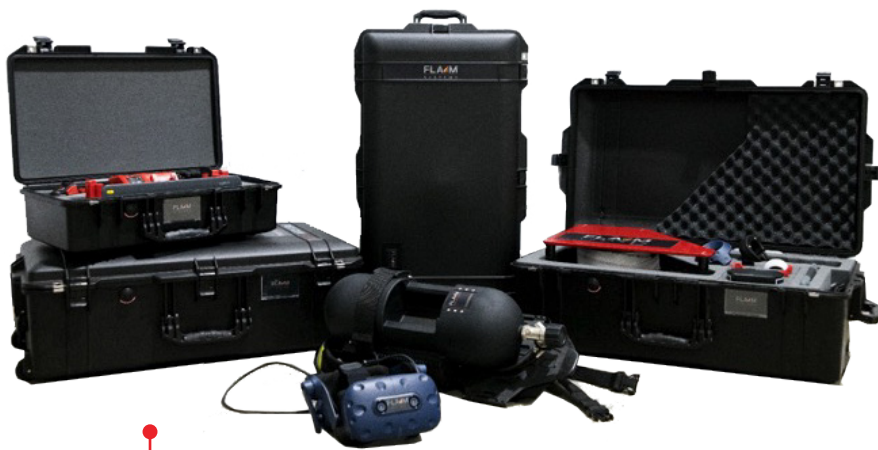
Figure 1: The FLAIM Trainer system