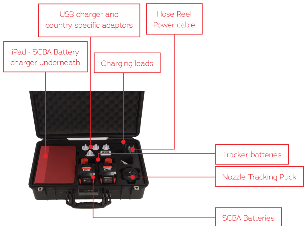
Figure 3: Standard packaging of support components